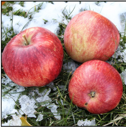
Summerdale Seedling (‘Wealthy x McIntosh’)

All trees are grafted onto dwarfing (B9) or semi-standard (B118) sized rootstock. Dwarf trees require support and grow to be ~8' tall. Semi-standard trees will grow to ~16'. Cold hardy to Zones 3 and 4, all trees in this program have been selected for their ability to withstand Montana's rugged conditions.